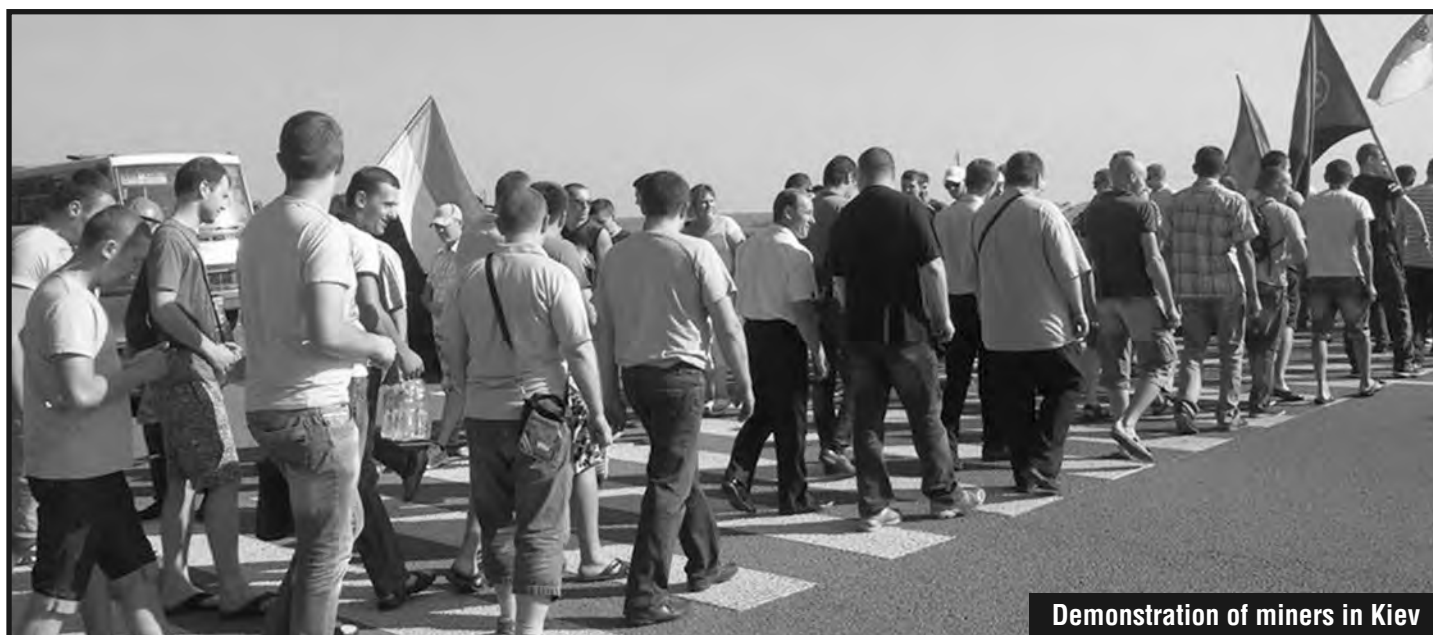
Demonstration of miners in Kiev