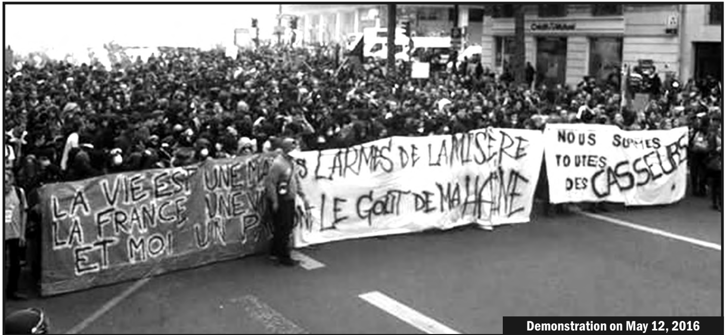
Demonstration on May 12, 2016

ments in which the bourgeoisie was weaker, and showed in the Senate a fortress that it hadn't.