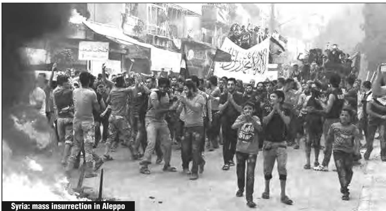
Syria: mass insurrection in Aleppo