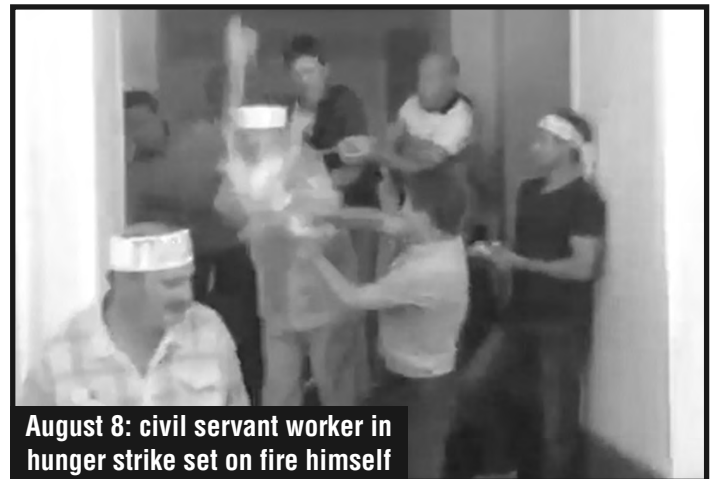
August 8: civil servant worker in hunger strike set on fire himself

August has started and Western miners of Ukraine once again are fighting for what belongs to them. Most of the workers in the coal state mines in the Western region, controlled by Kiev's government, have been from 3 to 6 months without getting paid their low wages!