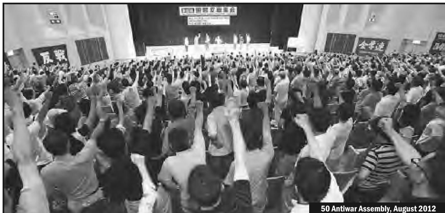
50 Antiwar Assembly, August 2012

We have now almost 5 and a half years of a hard revolution, and no less cruel counter-revolutionary blows