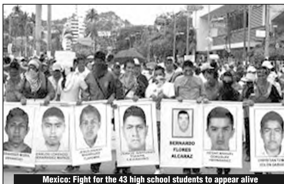
Mexico: Fight for the 43 high school students to appear alive

The English SWP is a real center of organization of the forces of the world reformist left. It has transformed the flag of "UK independence" on a matter of principle of its program. We are facing a real focus