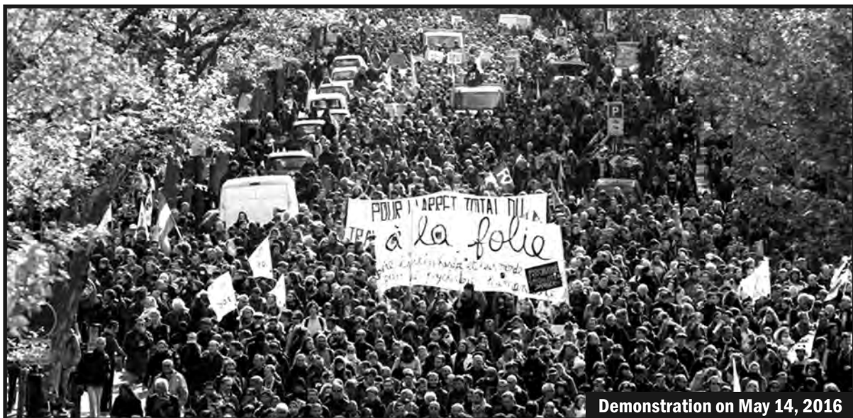
Demonstration on May 14, 2016

Out with the union bureaucracy! Open the path to the assemblies, factory committees and action!