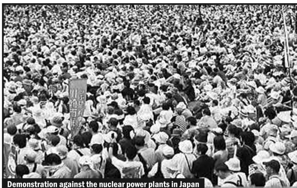
Demonstration against the nuclear power plants in Japan

Let's put up an International counter-Conference, because solidarity, funds, drugs and volunteers are required to break through the encirclement to the Syrian revolution and stop the genocide against the people!