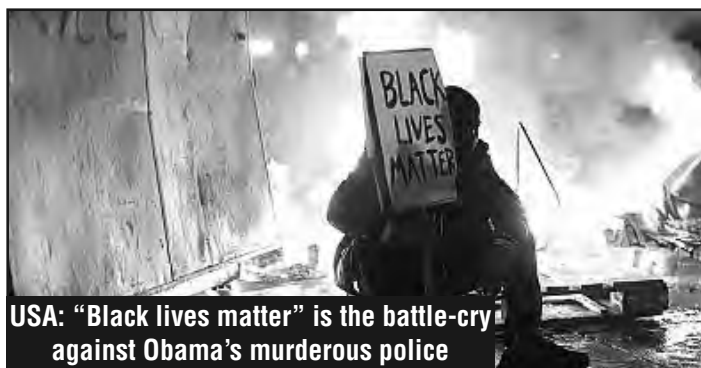
USA: "Black lives matter" is the battle-cry against Obama's murderous police