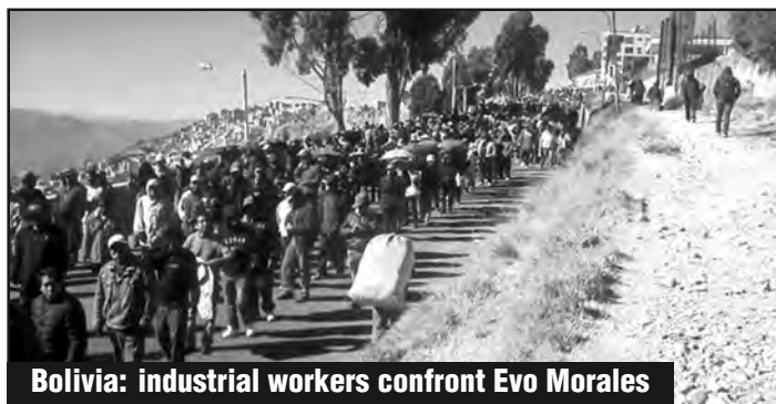
Bolivia: industrial workers confront Evo Morales