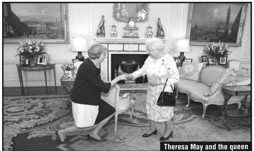
Theresa May and the queen

Neither the SWP-in an electoral front with the British Communist Party-, and the RMT (Transport Workers Union) -that called to leave the EU-, nor the other British left currents linked to the bureaucracy of the TUC, or the British party linked to the French NPA, that called the working class to vote stay in the EU, in a "Maastricht United", have shown the