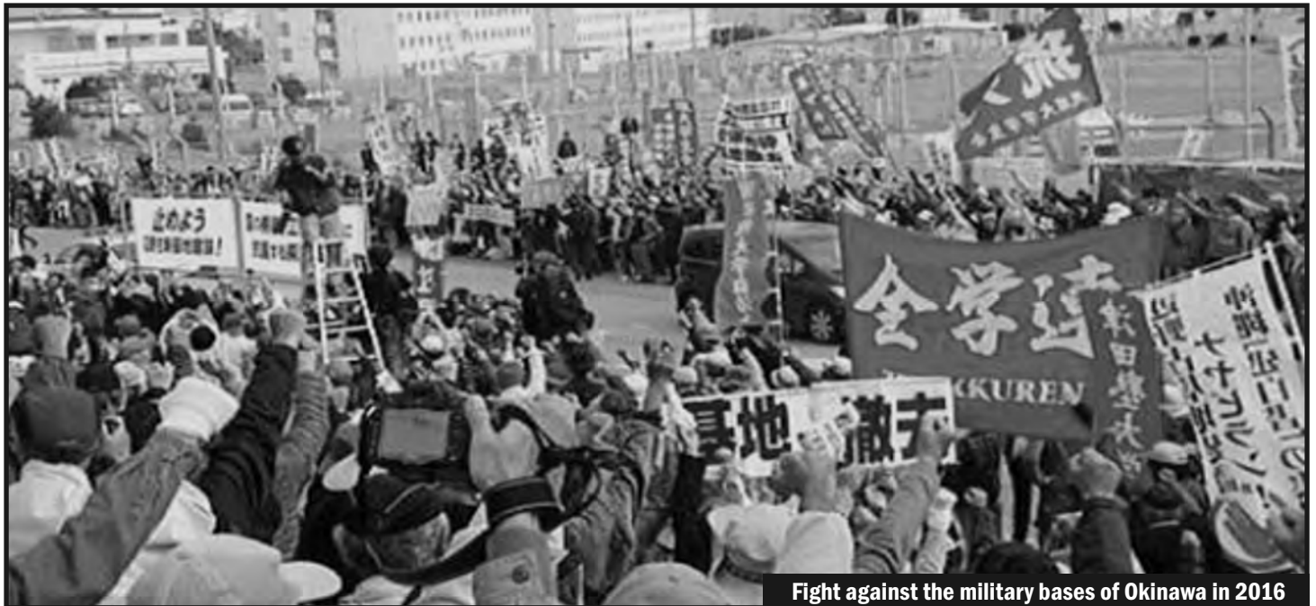
Fight against the military bases of Okinawa in 2016

Comrades, It's time of the militant internationalism. It's crystal clear that reformism, expressed as social-chauvinism and those who sold out the world proletarian revolution, has been recruited by the big capital to divide the international combat of the working class. They will not achieve it. They cannot achieve it! Our struggle is about it.