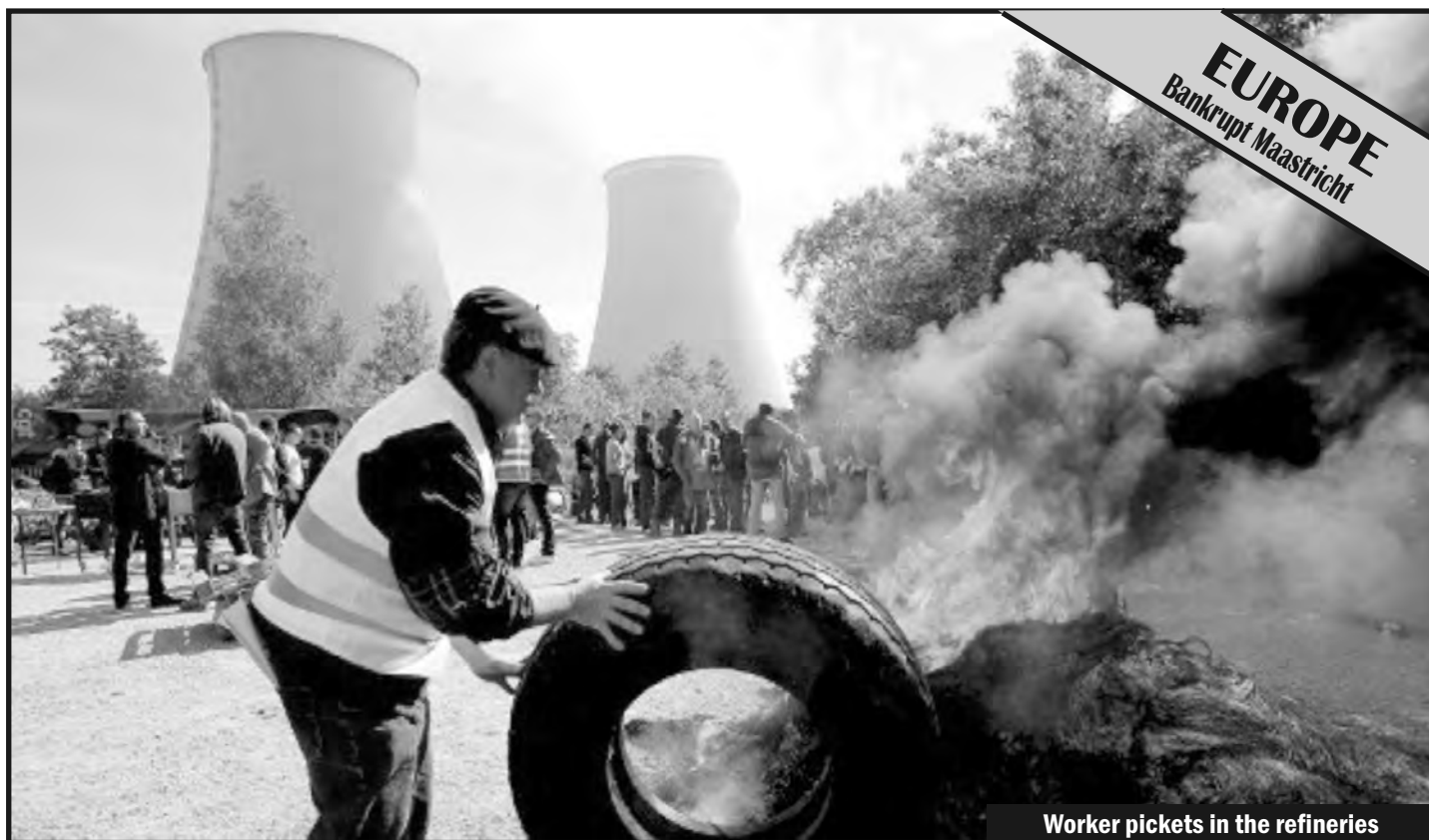
Worker pickets in the refineries

Republic were totally weak, hung by a thread; they had lost control of the working class, because it had broken with the control of the watchdog, the union bureaucracy and its program of putting pressure to the parliament to moderate the adjustment.