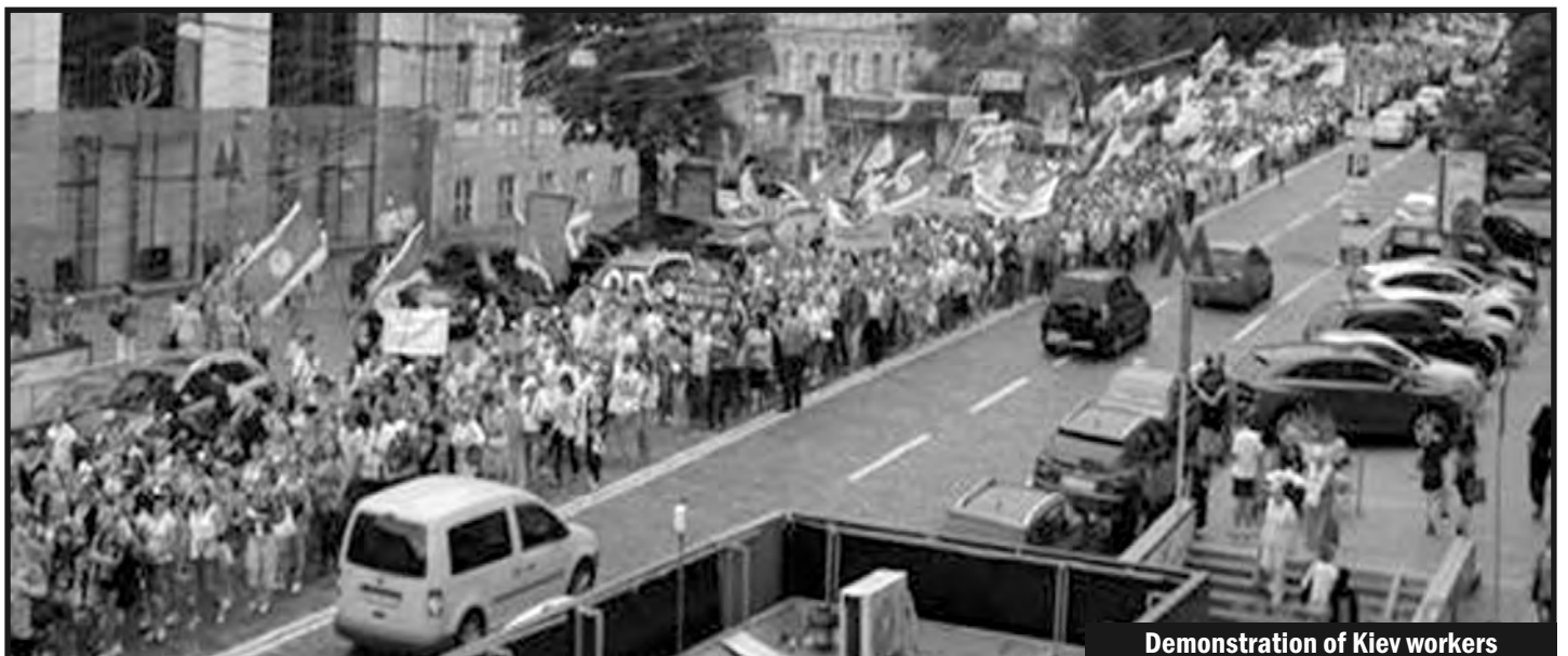
Demonstration of Kiev workers

The fight of the masses from Kiev is a huge anti-imperialist fight, against the plans of starvation and misery dictated by IMF